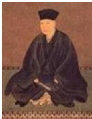
Sen no Rikyu (1522~91)

This poem describes lonely scenery at the sea shore in the autumn without using any subjective literal expression, so that this poem is often considered to be the symbol of simple Japanese tea ceremony originated in Sen no Rikyu (1522~91). Refer to Appendix for the details.